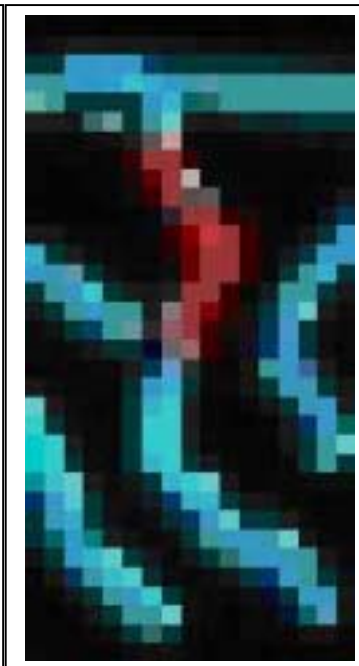
Fig 2 (left) shows a Kamchatka NW river.

Kamchatka exhibits a good set of coastal rivers along its W side, so I looked for, and found symmetries between its N, S coastal rivers and S, N coastal river potentials, Obs 38-9.