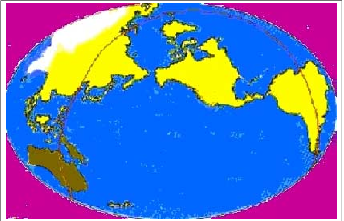
Fig 2: The Yellow and Yellowish regions are the Impact Hemisphere (IH) and IH-IR buffer (page 22). Mutually corroborative and meaningful correlations are obvious:

Any causal arrow could only be pointing from geology to politics, from super huge impact-effected differentials, of landforms, climates and so on, to meme-gene (Blackmore 1999) co-evolution.